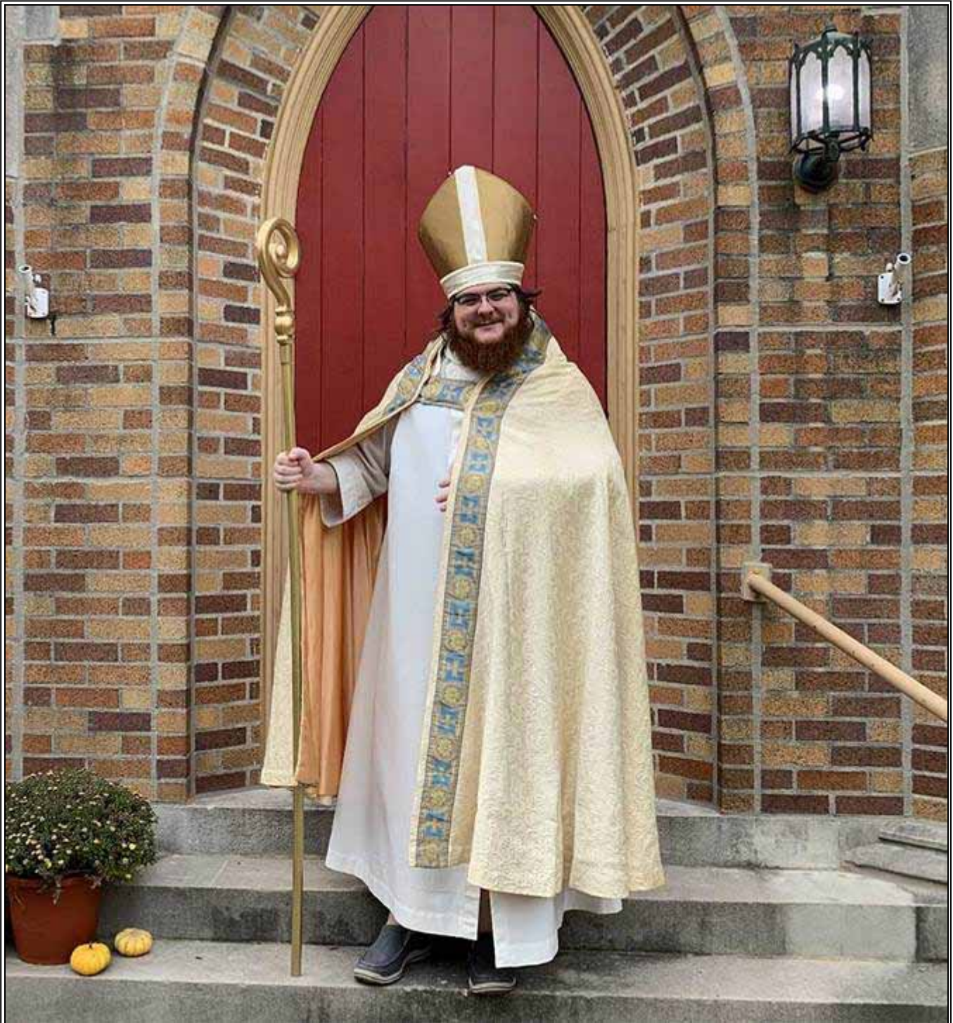
St. Nicholas Visits St. Alban's Church