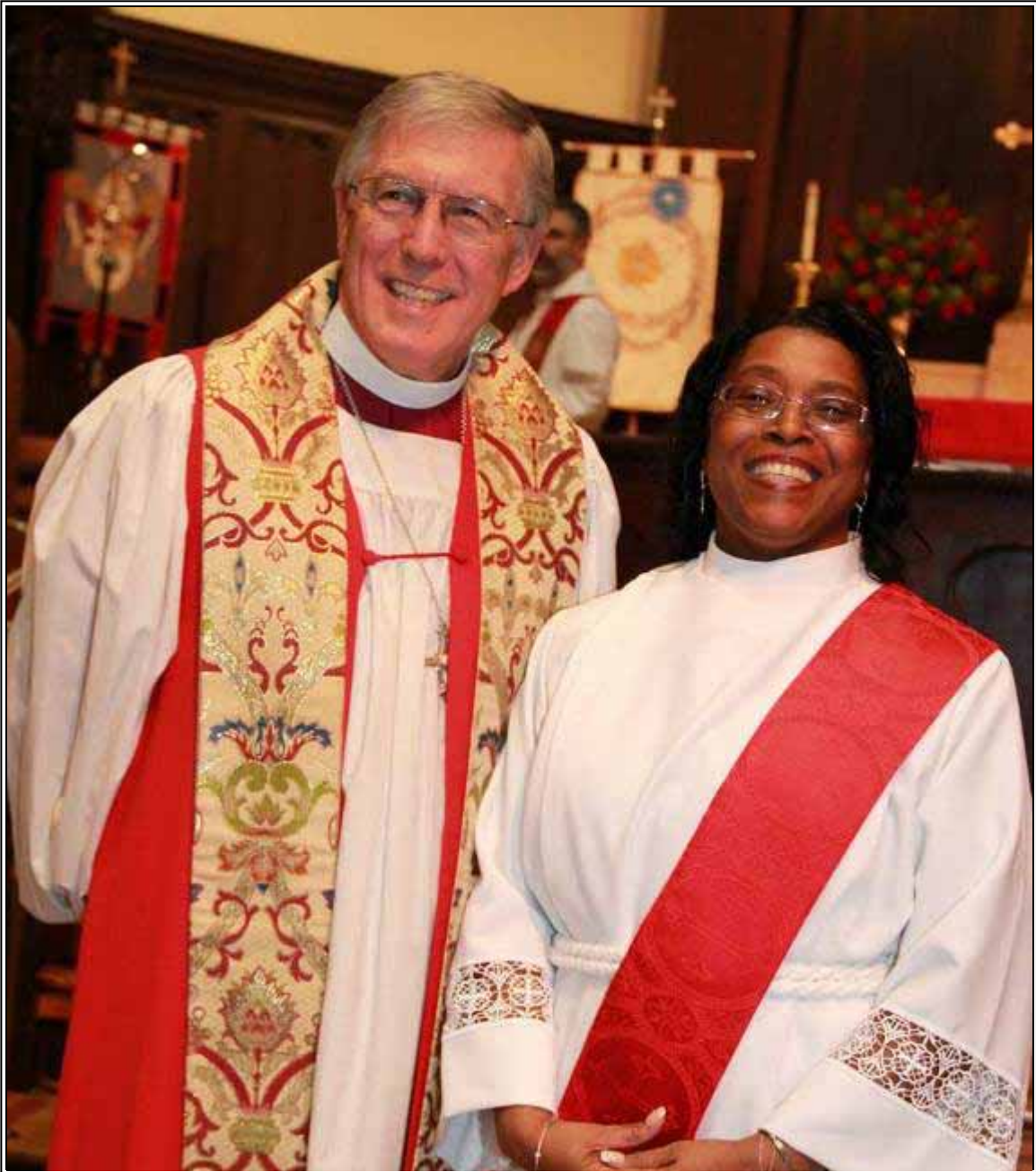
St. Andrews Cathedral January 15, 2011